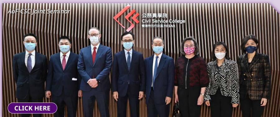
AoF-CSC Joint Seminar