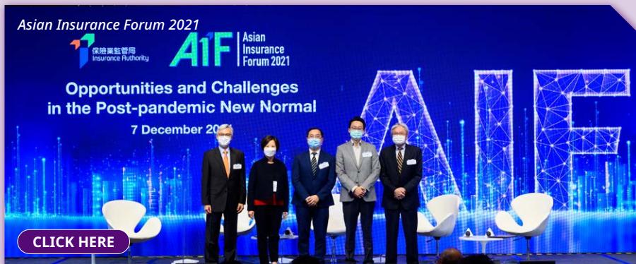
Asian Insurance Forum 2021