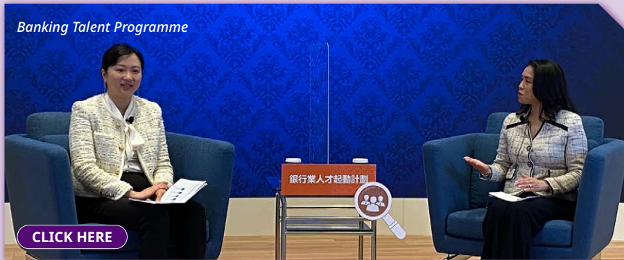
Banking Talent Programme