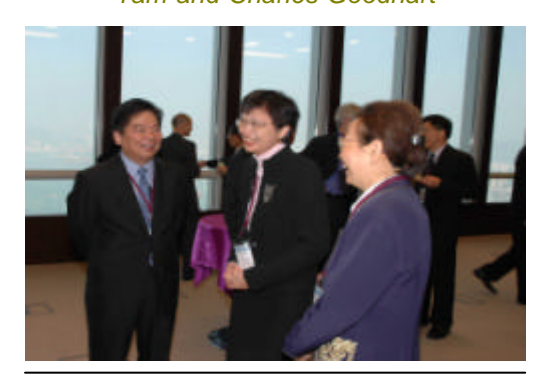
Discussions during coffee break

The Institute co-organised a conference on "Managing Procyclicality of the Financial System: Experiences in Asia and Policy Options" with the International Monetary Fund (IMF) on 22 November 2004.