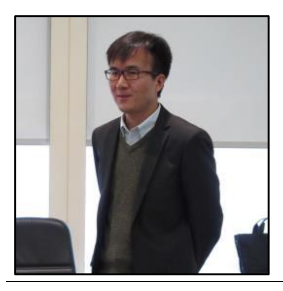
HKIMR is a great place to visit. It not only provides visiting fellows comfortable environment to conduct research dedicatedly, but has an outstanding group of scholars to communicate with.

During my visit to the HKIMR, my primary research interest was to explain the rise of informal finance in China over the past two decades. Informal finance aims to provide micro-credit and financial services to small businesses, but operates outside the formal state banking system. Given the lack of legal protection, informal financial activities are usually sustained by traditional, informal rules inherited from their historical counterparts. For this reason, I examined whether traditional banks (qianzhuang and piaohao)—that prospered in the Qing dynasty but declined thereafter—have a long-term impact on the current development of informal finance. A thesis central to this study is that, although traditional banks declined after the end of the dynastic rule (1911), the culture they embodied—in particular the Confucian norms (e.g., trust, righteousness, and kinship solidarity) that could enforce credit contract—continues to survive to this day, which in turn stimulates informal finance.