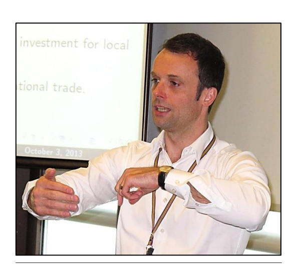
"The HKIMR is more than just an ideal place to conduct research from. It is also plugged directly into one of the most vibrant research communities in Asia, indeed in the world."

Coming back in October opened the door to a whole different Hong Kong. Strolling the streets became an option at any time of the day, as was hiking the spectacular trails and the wilderness areas that are quite unbelievable to any tourist who has not spent time in Hong Kong outside of the summer months. My wife joined me for part of the stay: together we explored with great wonder the nearby islands, the peaceful temples or nunneries around the city, and the spectacular food scene. Being vegetarian, it was especially