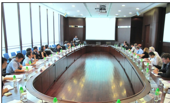
Conference speakers and discussants

The conference programme, part of the papers and presentation slides can be accessed on the HKIMR website by the following link: http://www.hkimr.org/conferences_detail-id73