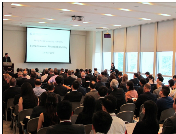
Over one hundred conference participants