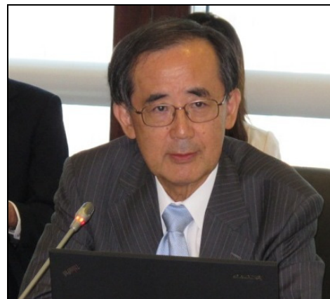
Mr Masaaki Shirakawa (Former Governor of Bank of Japan)

In this seminar, Mr Shirakawa shared his views on the Japanese unconventional monetary policies (UCMP). He thought there were four factors that affected the effectiveness of the UCMP in Japan: the degree of balance-sheet adjustment or de-leveraging of banks, the decline in the potential growth rate, whether there was simultaneous adoption of UCMP by other economies, and whether the country was a reserve currency country. He suggested that central banks should carefully weigh the possible costs and benefits of deploying UCMP, taking into account factors such as the flexibility of the economy and society, the nature of shocks, and whether or not the currency was a reserve currency.