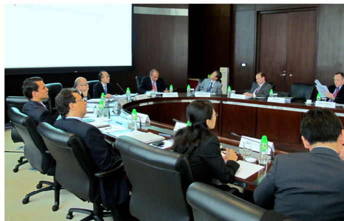
Conference speakers and session chairs