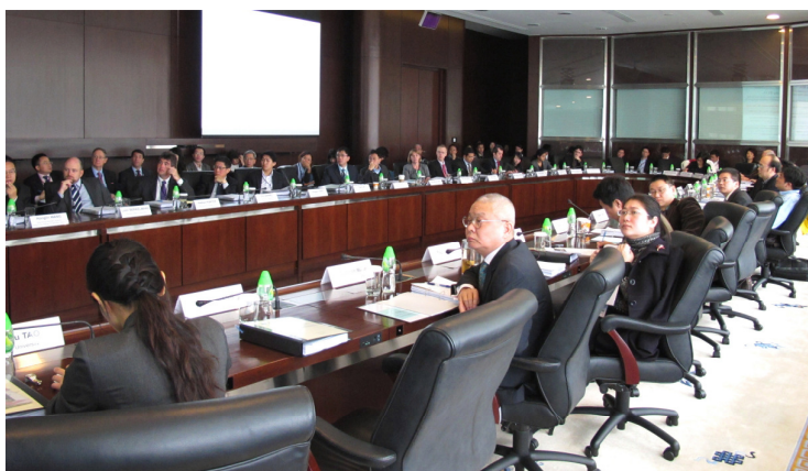
More than 100 conference participants

The conference programme and the papers can be found on: http://www.hkimr.org/conferences_detail.asp?id=62&callfrom=previous&page=1